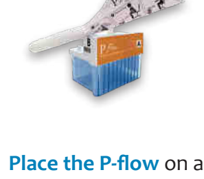
Unbox the P-flow, with attached funnel & pipe.